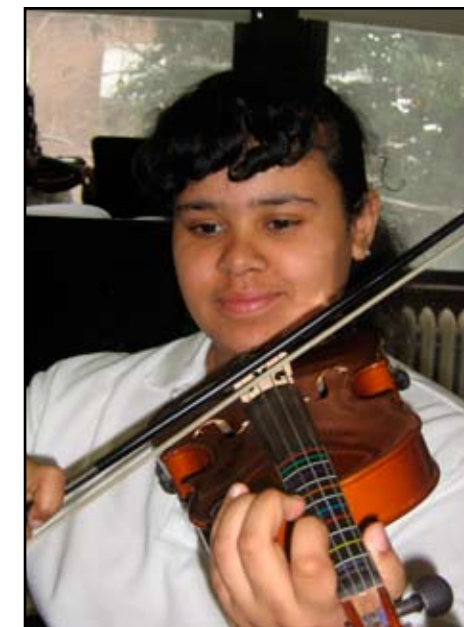
Holy Trinity's unique music and arts program integrates musical instruction into the school day, developing the discipline and joy of playing a musical instrument.