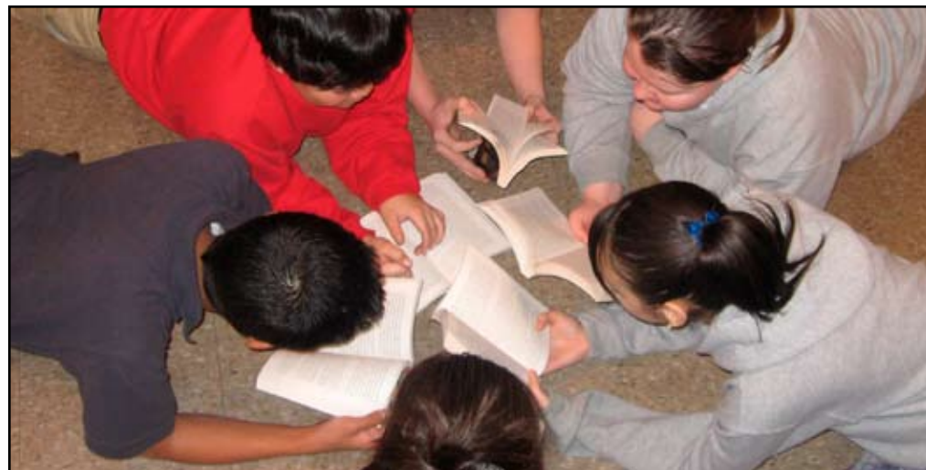
Seventh graders at St. Cecilia Academy read and discuss A Wrinkle in Time during literature circle.