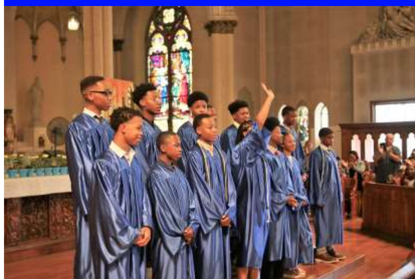
Most Holy Trinity School & Academy