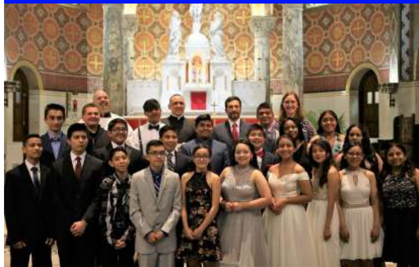
St. Cecilia School & Academy