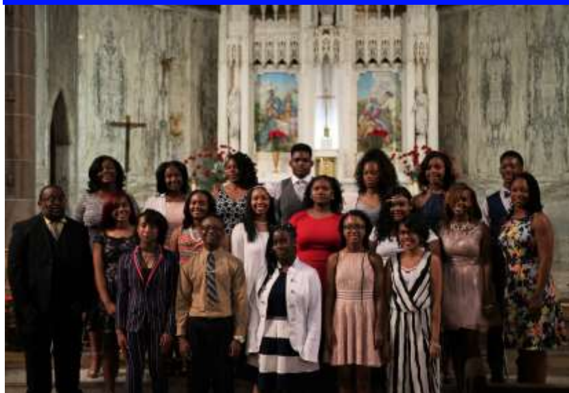
St. Louis Catholic Academy