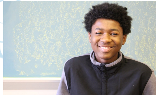
Tayon H. will be attending CBC next Fall!

More than 45 eighth grade students served by ACCESS Academies this year were accepted to the following private, college-preparatory high schools: